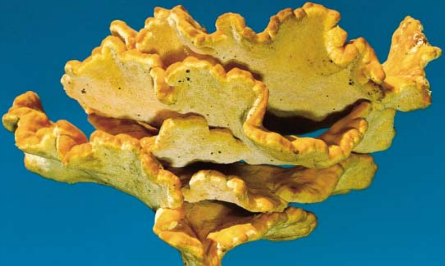
A spectacular Chicken-of-the-Woods or Sulphur Tuft ( Laetiporus sulphureus , syn. Polyporus sulphureus ) specimen collected from the Soleduck River drainage of the Olympic Peninsula, Washington State.

raceae), did not stifle the E. coli remotely, but its mycelium consumed the E. coli upon contact. F. fomentarius , as well as other polypores, have anti-viral properties. 6,24,25 A highly water soluble, low cytotoxic polysaccharopeptide (PSP) isolated from T. versicolor has been proposed as an anti-viral agent inhibiting HIV replication. 4 The fact that mushrooms can have both anti-viral and antibacterial properties, with low cytotoxicity to animal hosts, underscores their usefulness as natural sources of medicines.