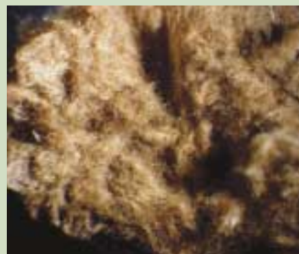
The "wooly mass" in possession of the Ice Man. Made from Fomes fomentarius , the hardened wood conk is first moistened, and then pounded until the hyphae separate. This material is highly flammable, and can be woven into garments.

Says Dr. Capasso, "An analysis of the content of the Ice Man's rectum revealed Trichuris michiura eggs, which cause a condition that might have progressed without symptoms, but more likely resulted in abdominal pain and cyclic anemia."