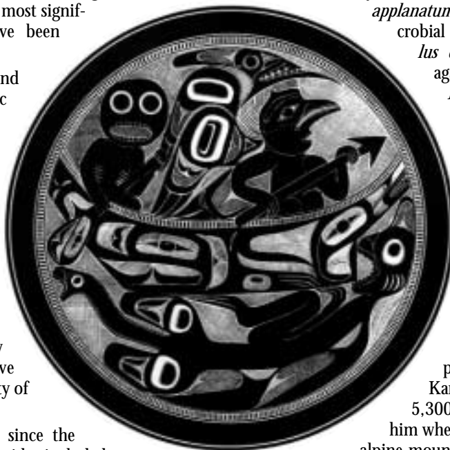
Drawing of an argillite plate, carved by Charles Edenshaw in approx. 1890, depicting the Haida myth of the origin of women. Fungus Man ( Fomitopsis officinalis ) is paddling the canoe with Raven in the bow in search of female genitalia. Diameter = 35 cm. Redrawn from a photograph, courtesy of the Field Museum of Natural History, Chicago.

Of these four species totally inhibiting E. coli , three were polypores cloned by the author from the Old Growth forests of the Pacific Northwest of North America: Ganoderma oregonense Murr., artist conk ( G. applanatum ), and the tinder fungus ( F. fomentarius ). A fourth polypore, turkey tail ( Trametes versicolor (L.:Fr.) Pilát, Polypo-