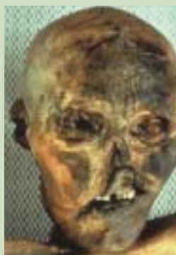
Otzi or the Ice Man, who used mushrooms more than 5,000 years ago.

The discovery of the mummified human body known as the "Ice Man" in a glacier in the Italian Alps in September 1991 caused great excitement in the scientific world. Luigi Capasso, an anthropologist at the National Archeological Museum in Chieti, Italy, reported in The Lancet that the two walnut-sized lumps carried by this individual have been identified as the woody fruit of Piptoporus betulinus , a bracket fungus common in alpine and other cold environments. P. betulinus contains toxic resins