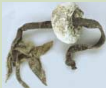
The Birch Polypore ( Piptoporus betulinus ) is thought by many to have been used as an anti-microbial agent.