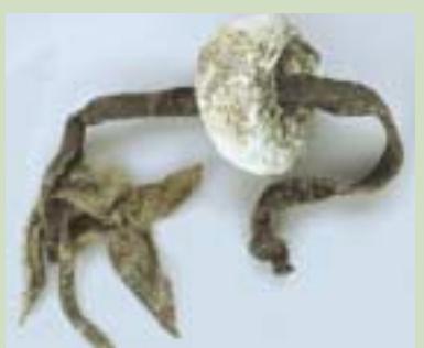
The Birch Polypore ( Piptoporus betulinus ) is thought by many to have been used as an anti-microbial agent.

Ice Man may have been aware of his intestinal parasites and fought them with possibly the only remedy then