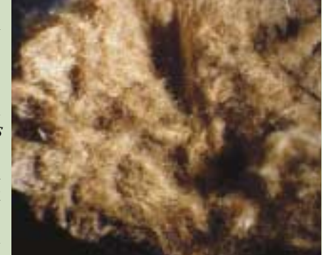
but<br/>likelyThe "wooly mass" in possession of the Ice Man.likely<br/>in<br/>in<br/>in a l<br/>cyclicMade from Fomes fomentarius, the hardened<br/>wood conk is first moistened, and then pounded<br/>until the hyphae separate. This material is highly<br/>flammable, and can be woven into garments.

Says Dr. Capasso, "An analysis of the content of the Ice Man's rectum revealed Trichuris michiura eggs, which cause a condition that might have progressed without symptoms. more resulted abdominal pain and cyclic anemia.'