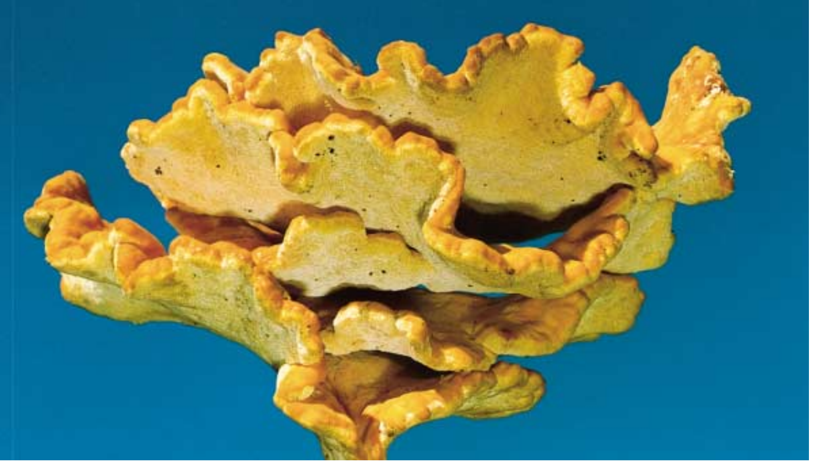
A spectacular Chicken-of-the-Woods or Sulphur Tuft ( Laetiporus sulphureus , syn. Polyporus sulphureus ) specimen collected from the Soleduck River drainage of the Olympic Peninsula, Washington State.

raceae), did not stifle the E. coli remotely, but its mycelium consumed the E. coli upon contact. F. fomentarius , as well as other polypores, have anti-viral properties.<sup>6,24,25</sup> A highly water soluble, low cytotoxic polysaccharopeptide (PSP) isolated from T. versicol or has been proposed as an anti-viral agent inhibiting HIV replica-