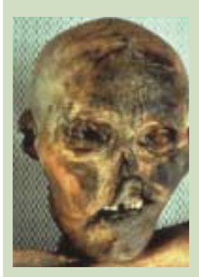
Otzi or the Ice Man, who used mushrooms more than 5,000 years ago.

The discovery of the mummified human body known as the "Ice Man" in a glacier in the Italian Alps in September 1991 caused great excitement in the scientific world. Luigi Capasso, an anthropologist at the National Archeological Museum in Chieti, Italy, reported in The Lancet that the two walnut-sized lumps carried by this individual have been identified as the woody fruit of Piptoporus betulinus, a bracket fungus common in alpine and other cold environments. P . betulinus contains toxic resins